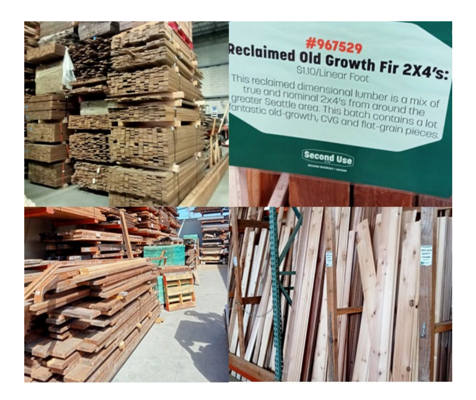
Figure 10 Timber on display at Provenance, Second Use, Placemakers, and ReBuilding Center.

Not-for-profits are also innovative in seeking new items and materials for recovery and reuse. An example is Urban Ore which has identified that equipment from solar power systems renewals is being discarded, despite still having useful life left in it. Urban Ore is recovering this equipment and making it available for reuse.