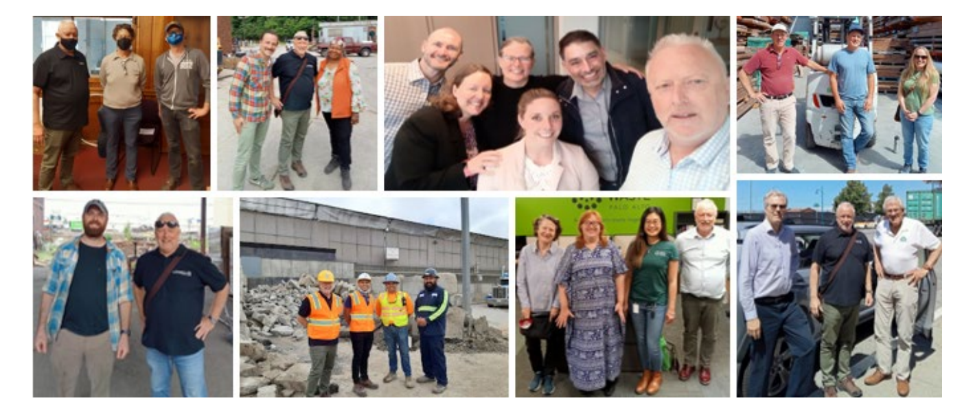
Figure 16 A selection of amazing people doing great work to tackle construction and demolition waste.

This personal investment is also present in the local and central government officers I met. Developing policy, gaining political interest, and implementing initiatives in any aspect of waste minimisation takes a long-term perspective, and again, I saw a lot of investment in the cause from people working on this.