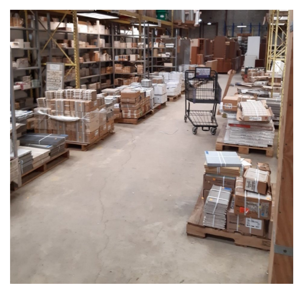
Figure 15 Pallets of brand-new unused tiles for sale at Community Forklift

A further source of stock for reuse organisations is new surplus materials no longer required by builders and other businesses. It is not unusual for materials to be left over from building projects due to the prevalence of over-ordering. Wholesalers also over-order stock and having relationships with these businesses is a valuable source of new materials for sale. In most locations, we saw many new, unopened boxes of tiles that had been over-ordered for building projects. Refits of hotels are also a regular source of quality fixtures and fittings. Maintaining strong relationships with local businesses can be an important way of obtaining excess and new stock.