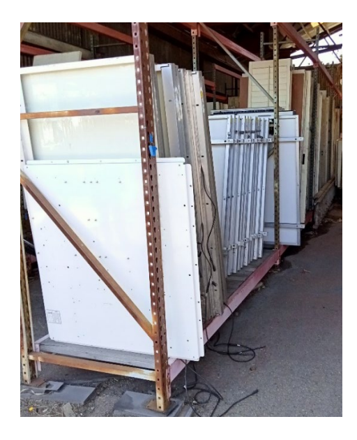
Figure 11 Recovered solar panels awaiting reuse at Urban Ore.

Not-for-profits are also innovative in seeking new items and materials for recovery and reuse. An example is Urban Ore which has identified that equipment from solar power systems renewals is being discarded, despite still having useful life left in it. Urban Ore is recovering this equipment and making it available for reuse.