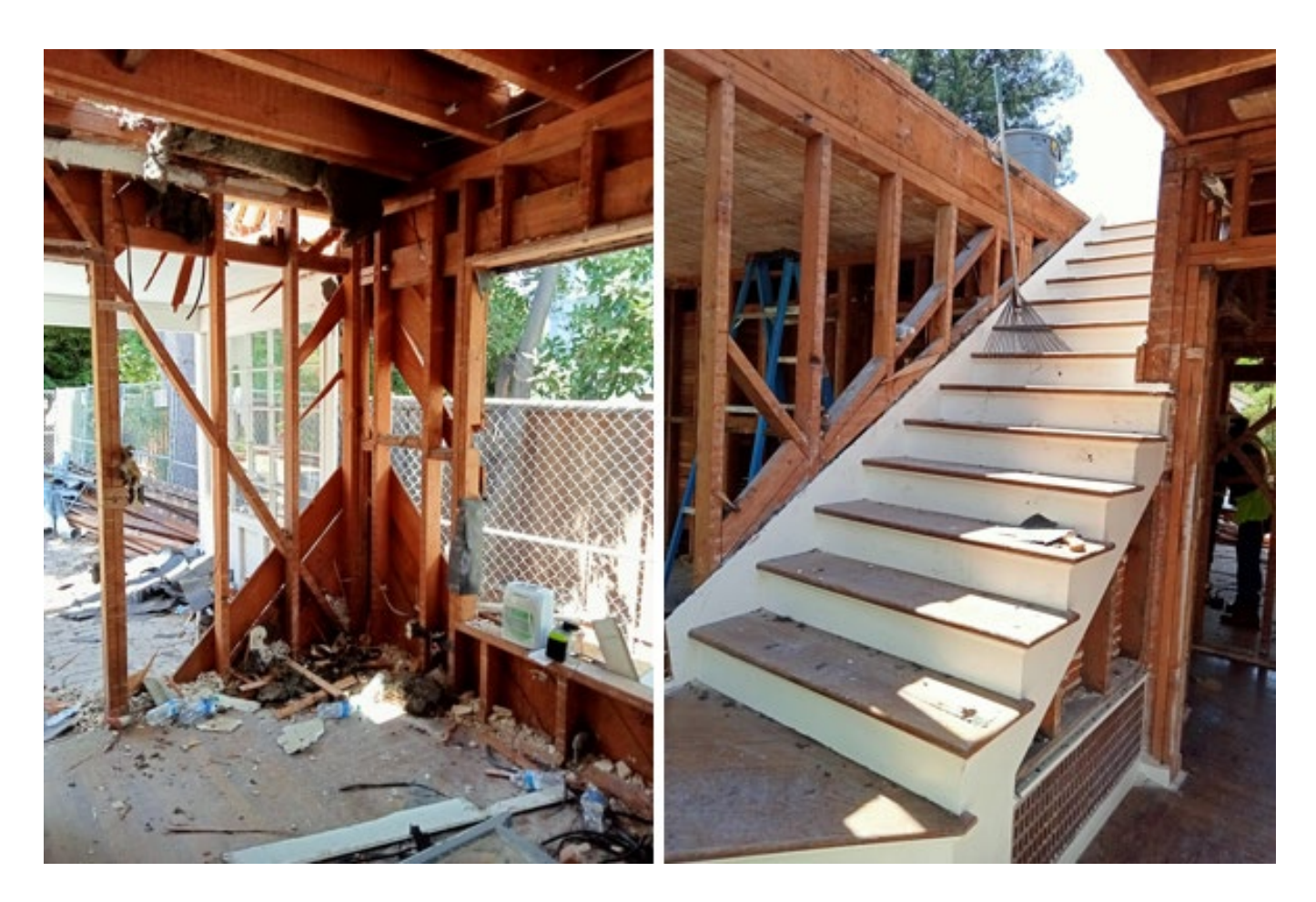
Figure 17 Residential building undergoing deconstruction in Palo Alto

Since July 2020, The City of Palo Alto, CA, has sought to reduce the volume of the two major sources of waste in the city, food waste and construction and demolition waste. In the case of demolition waste, the city has implemented an ordinance that has banned site clearances by demolition in favour of deconstruction. The ordinance requires the careful disassembly of building components to maximise the recovery of materials, fixtures, and fittings.