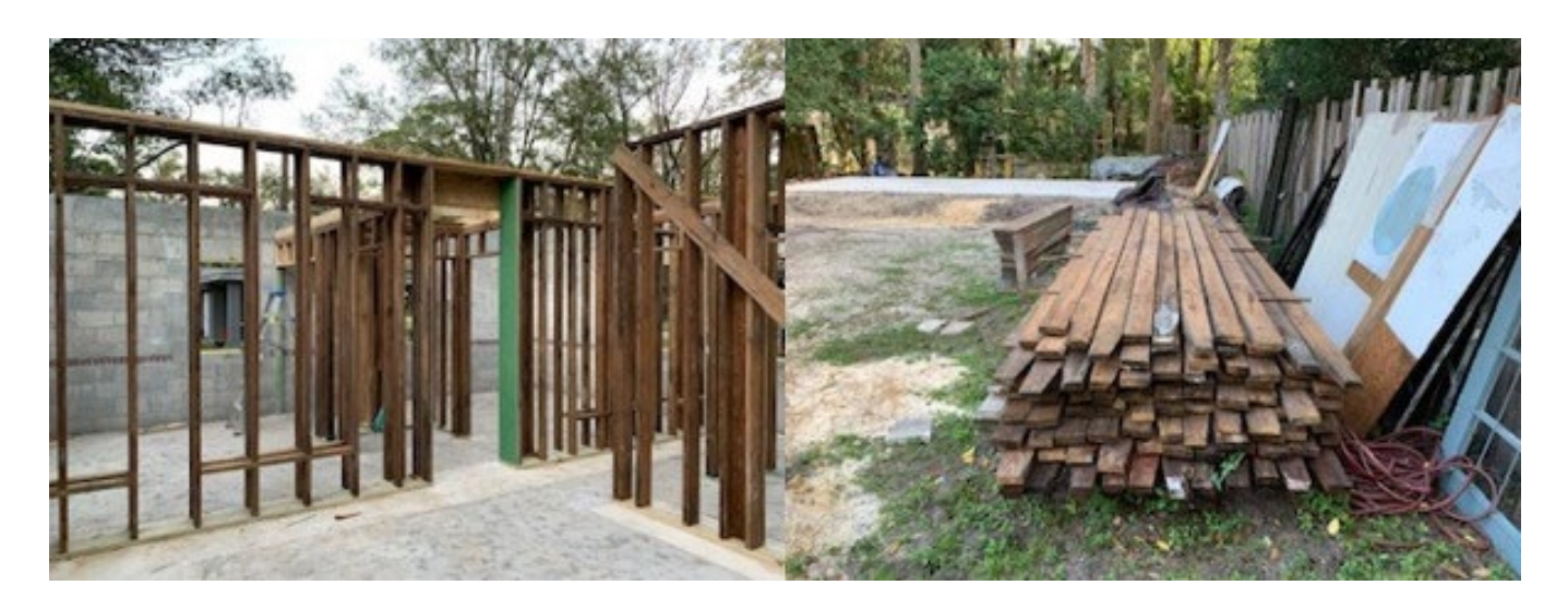
Figure 12 Reclaimed timber framing.

It is commonly believed that reclaimed materials can only be used for furniture making, interior fit-out, and landscaping. Florida-based architect and academic Bradley Guy has devoted a career to discovering and teaching how reclaimed materials can be used again, along with creating energyefficient buildings.