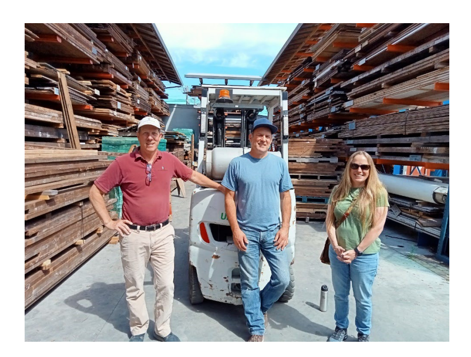
Figure 14 Placemakers Inc. partnership with the City of San Bruno

The most successful reuse organisations have built strong and enduring relationships with other businesses and within their local communities. Ensuring a regular supply of stock and ongoing sales means being able to work with others. In the case of deconstructed materials, this typically means working with deconstruction contractors and building appraisers who facilitate tax rebates for developers. Deconstruction contractors regularly use the same reuse and salvage destinations for their recovered materials.