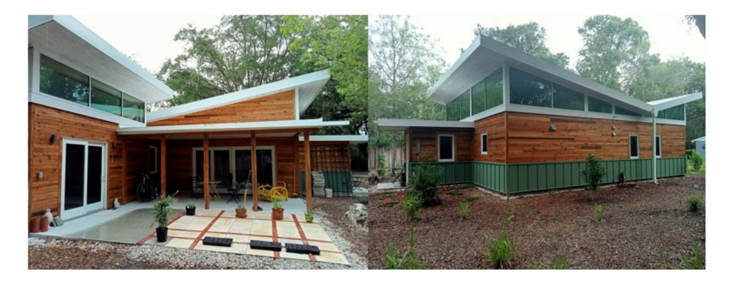
Figure 13 Reused timber can be seen in the cladding and soffits.

From the street, the house looks like a stylish, architecturally designed home. On closer inspection, the integration of the materials from the previous home gives the home strong texture and interest. Reclaimed timber has been used in the cladding, soffits, internal detailing as well as the framing. The house even sits on the footprint of the previous home.