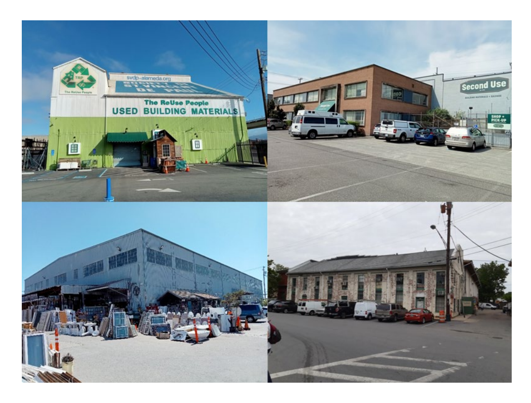
Figure 6 ReUse People of America, Second Use, Urban Ore, and Community Forklift.

Having a large, secure, and enclosed warehouse building allows for a lot of stock of bulky items. It also allows their condition and value to be maintained and for items to be properly displayed. Keeping stock dry and out of the elements is vital for maximising resale value and creating an attractive and engaging shopping experience for visitors.