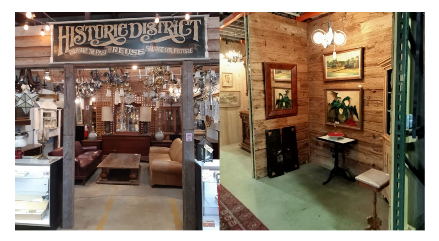
Figure 9 Merchandising displays at Community Forklift and Provenance

filleted into neat packets. This makes it easy for customers to locate what they are looking for and makes it eminently more usable.