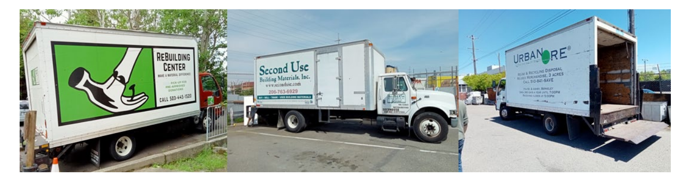
Figure 7 Examples of resource recovery collection vehicles.

Having their own vehicles also allows organisations to offer a delivery service. In most cases, pick-up and delivery are charged for, typically around $20.00. ReBuilding Center offers free pick-up and delivery to prevent transport from being a barrier to their community, either providing or buying materials.