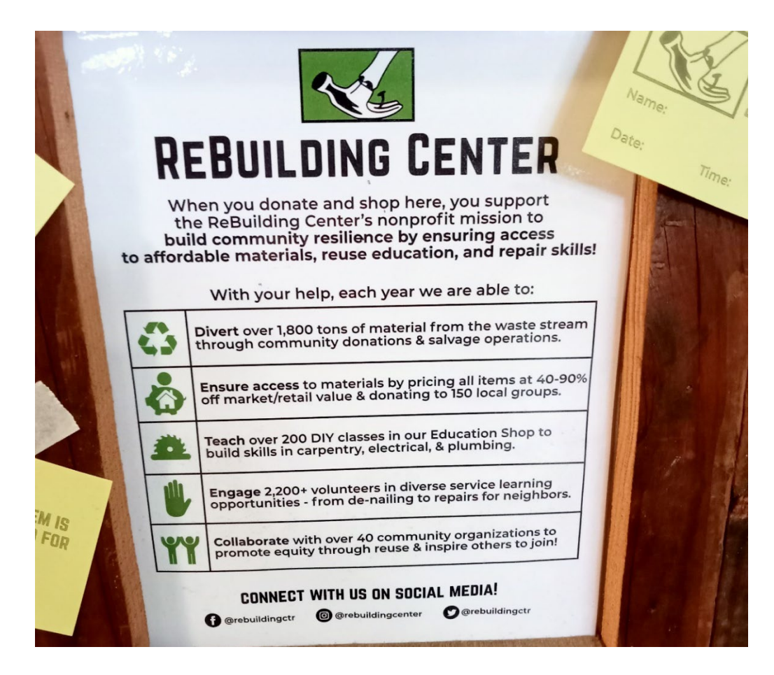
Figure 3ReBuilding Center information card

While numerous highly successful for-profit organisations are working in this area around the USA, not-for-profit organisations are also achieving great outcomes for their communities and diverting waste. Many of the difficulties faced by salvage and reclaim organisations, for example, having stable premises, are common to both.