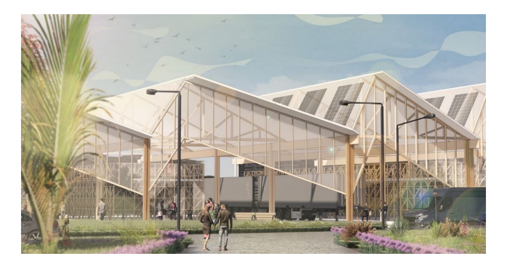
Figure 1 Artist's impression of the proposed EcoPark in South Auckland. (Southern Initiative).

A recent 'EcoPark' proposal (<u>https://tinyurl.com/w2u6jsx8</u>) describes a desire to flip Auckland's $5 billion waste problem into a catalyst that provides direct and measurable benefits for communities and, in doing so, reshaping the market in recovered and recycled materials at scale.