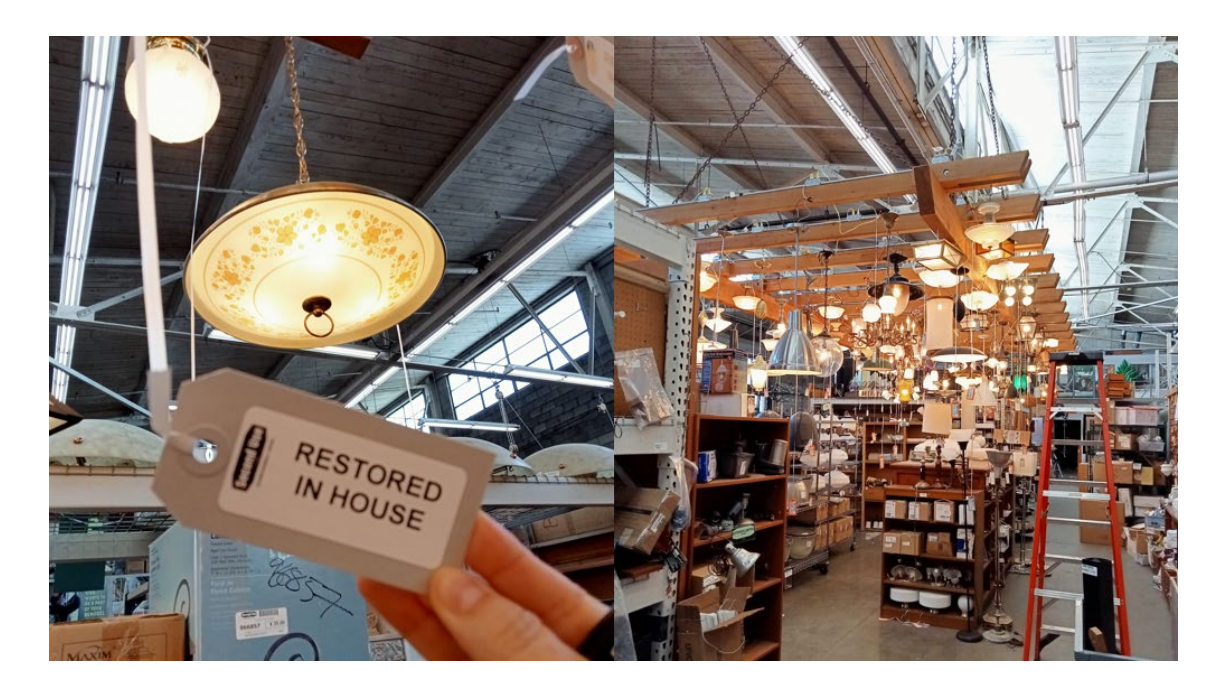
Figure 5 Lighting shop in the Second Use store.

Many facilities depend on deconstructed materials from site clearances and deconstructions. This work entails higher levels of labour to recover items in resalable condition and creates more jobs than would exist if buildings were demolished mechanically with a digger.