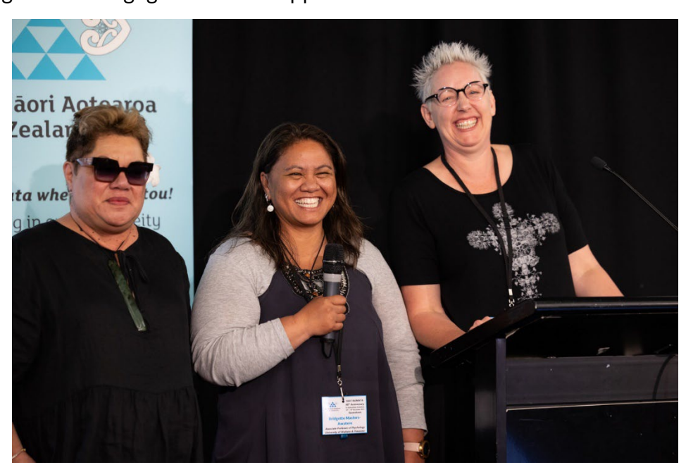
Figure 2: Presenting at KMA 2023 Hui Taumata

2023 Biennial Hui Taumata for Kāpō Māori Aotearoa: I presented at the Kāpō Māori Aotearoa Biennial Conference and contributed into the workshops and discussion regarding whānau engagement and support.