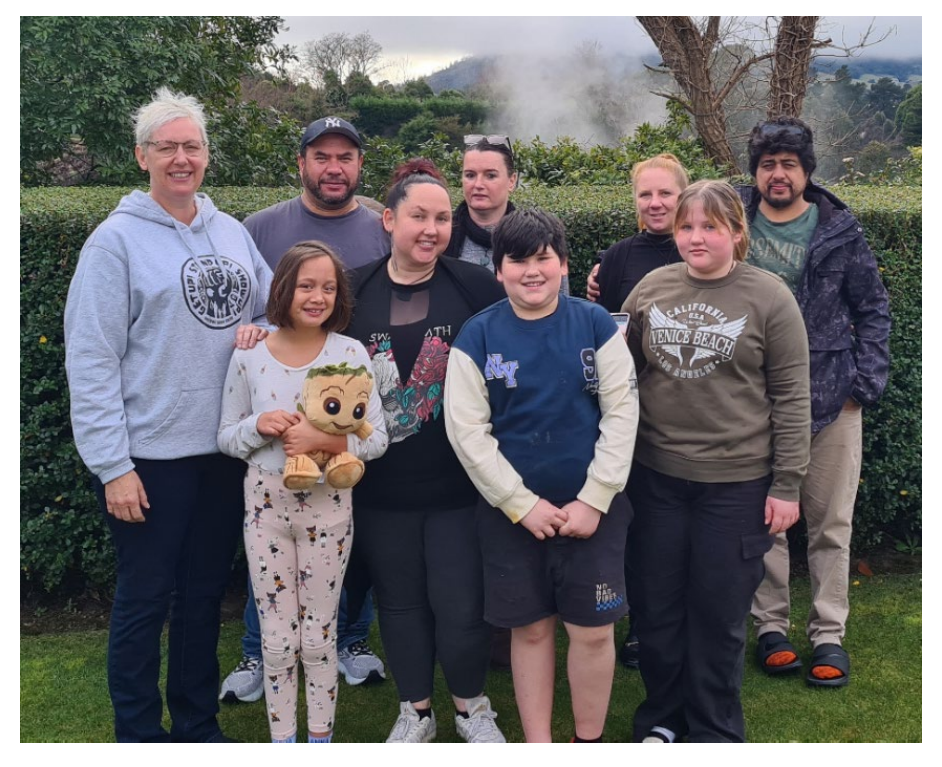
Figure 5: Attendees as the inaugural PVI whānau wānanga.

Noho-based wānanga for whānau: The inclusion of parents and whānau in England and Scotland was well in advance of offerings here in Aotearoa. Post-fellowship I secured additional external funding for a noho-based wānanga for tāngata whānau Māori within PVI. The inaugural wānanga was held in Taupō in July 2023, and a second is scheduled for Auckland in May 2024. These are intentionally oriented differently to the PVI Annual Conference. Drawing on international learnings as well as findings from the Royal Commission, these wānanga provide spaces for capacity building alongside respite and care in a culturally supportive way.