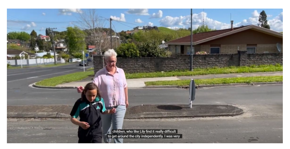
Figure 3: Screenshot from the Hamilton City Council campaign

Accessibility: Working with local council. Access to public transport, cycle lanes, and pedestrian spaces is notably behind here in Aotearoa New Zealand when compared to the cities I visited during my Fellowship. There is a need for local parents to have access to resources and templates to assist them in making submissions. Since my Fellowship I have worked alongside my local council (Hamilton City Council) to raise awareness of access needs of low vision children<sup>6</sup>.