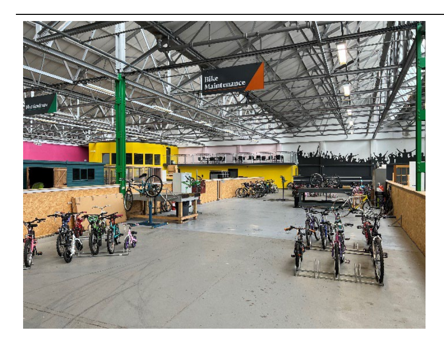
Figure 10: Skills Academy – Bike repair shop