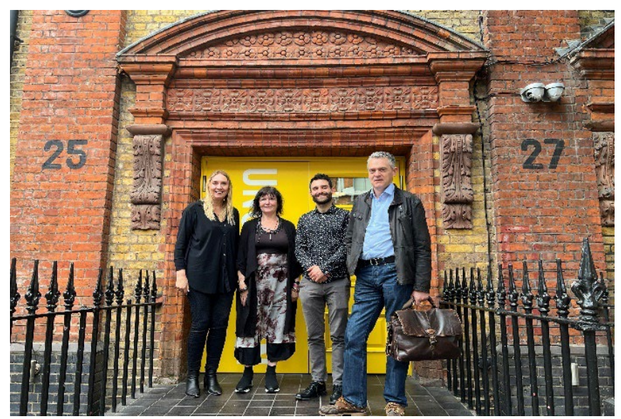
Figure 8: Outside the shared office space where I met with Family Psychology Mutual