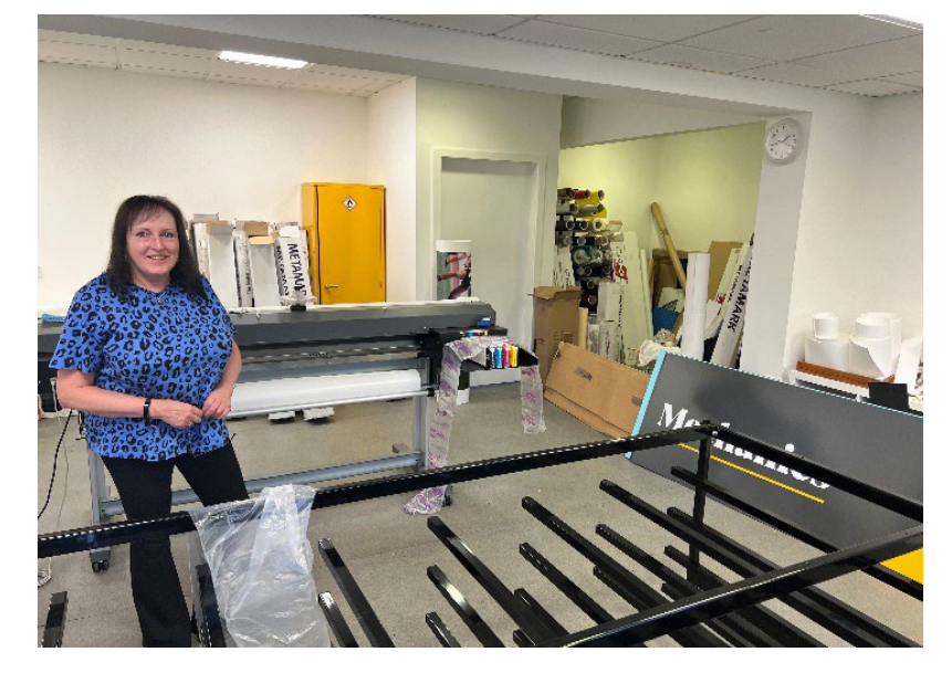
Figure 11: Skills Academy – Printing Work Area