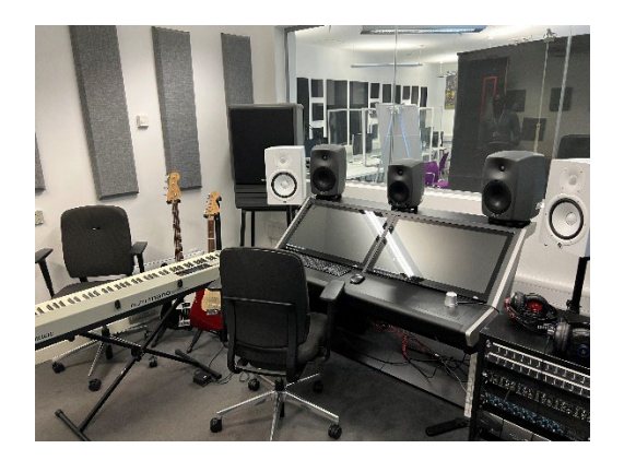
Figure 4: Lighthouse.

Figure 3: The Apprentices with their team leader and manager (and my gorgeous, gifted flowers)