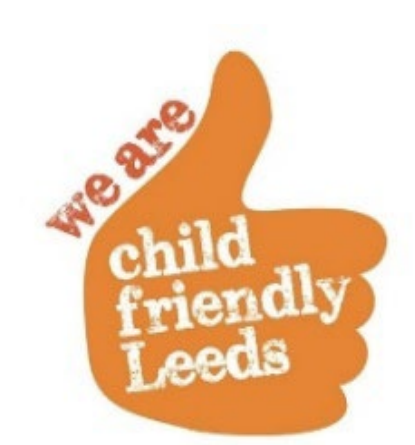
Figures 14: Campaign for Child Friendly Leeds, Leeds City Counil.