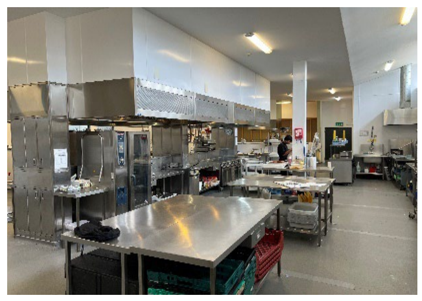
Figure 12: Skills Academy – Industrial Kitchen