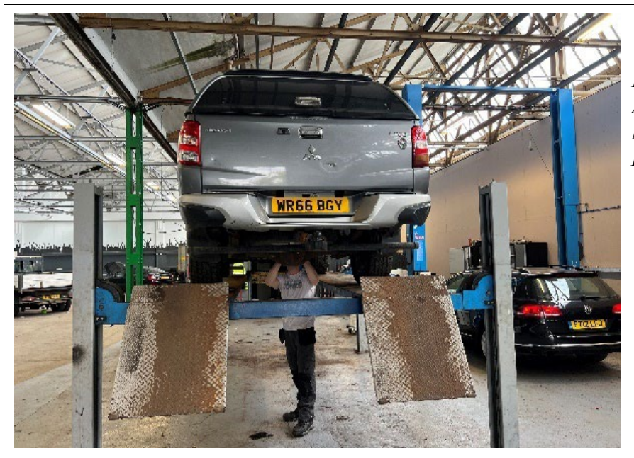
Figure 13: Skills Academy – Mechanical Engineering