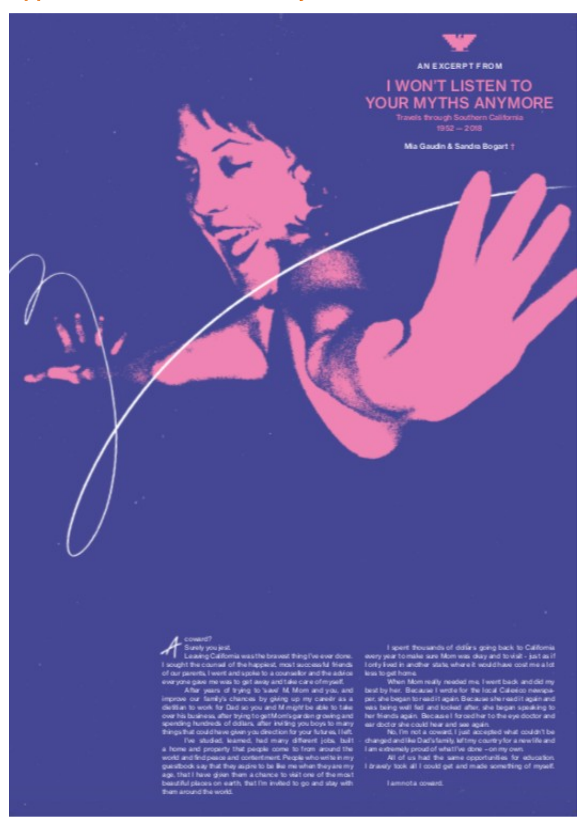
Appendix 2: Meanwhile Gallery Artwork