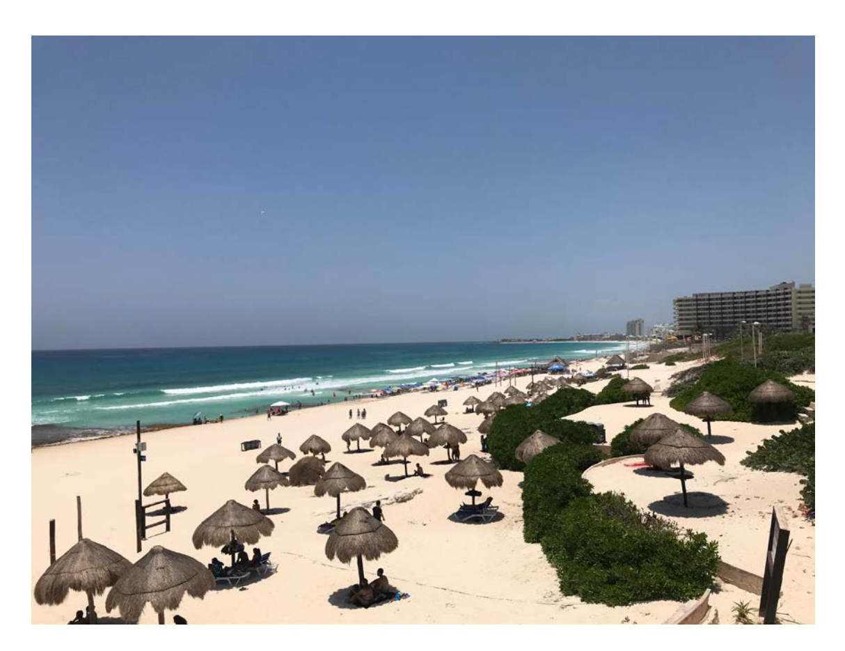
Cancun, hotels stretching to the end of the spit

drove along we listened to music he had on a USB stick plugged into the stereo. Don't Dream It's Over by Crowded House came on as we drove, the windows down and the breeze a welcome relief. We sung along together, his words a little garbled in his mouth, but both of us smiling, excited to be making this unlikely connection.