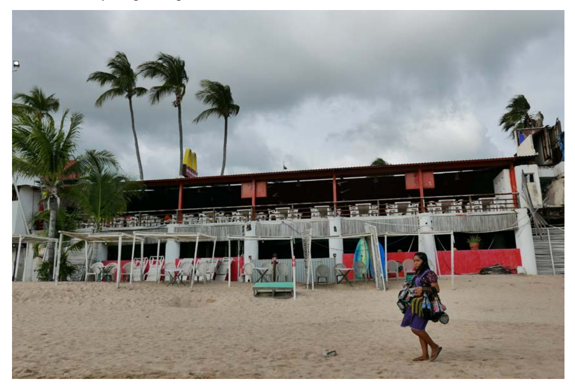
Caption: Woman selling bags on the beach, McDonalds in the background

effort to clean it back up and attract tourists, so Marion's trip there may have been the very beginning of that revitalization effort.