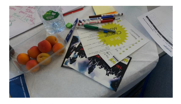
Figure 3: Planning Live training with Paradigm in Swindon (1)

Paradigm UK's Great Support Movement gave me several ideas on how we could connect supporters to each other as an important part of developing strong advocates.