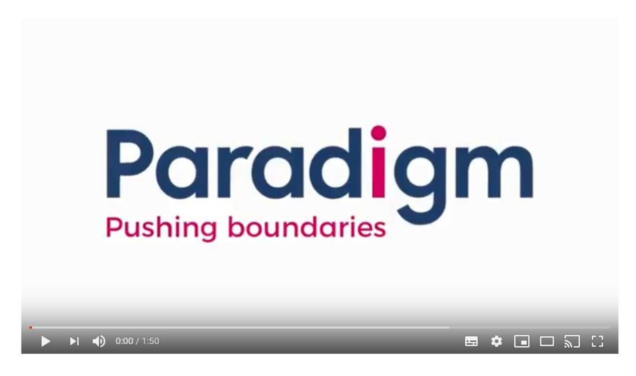
Video 1: an example we filmed on a sunny afternoon following a workshop with Paradigm UK.

IHC supports conference presentations. Opportunities to submit to conferences both in New Zealand and in Australia will be made for 2019/10. These will include conferences held by Australasian Society for Intellectual Disability, New Zealand Disability Support Network, New Zealand Association of Counsellors, and National Rural Health Conference. A list of conferences is regularly updated and explored by the Community Advocacy Team and approaches made to a variety of organisations. I have had the opportunity to share my learnings with IHC Programmes Management Team and Staff from Idea Services (IHC's service arm). My focus in these has been on encouraging the voice of people with intellectual disability, and ways in which this can be valued and implemented. I am fortunate that my role means that advice gathered from my learnings is sought regularly by people and their supporters.