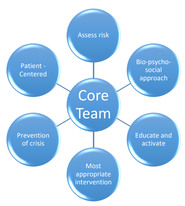
The Huddle - Source

managed by the Extensivist GP and the Complex care team, until the patient is stabilized and a plan in place then handed back to the GP practice.