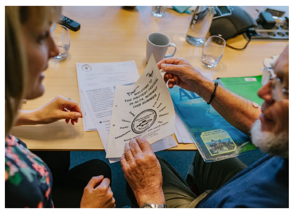
Above and over,: brochures from the Protest Festival listing courses in non-violent action.

Festival offered workshops and information about the Alta region, the dam and the canyon, and crucially about engaging in non-violent action. Per took one of these workshops. Posters advertising this in Swedish, German and English as well as Norwegian are in the Alta Museum.