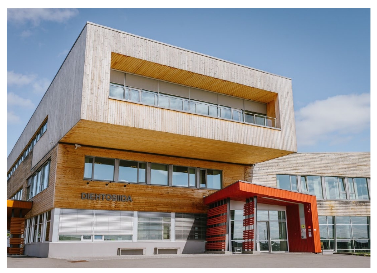
The Diehtosiida Campus is a striking building on the hill overlooking Guovdageaidnu.