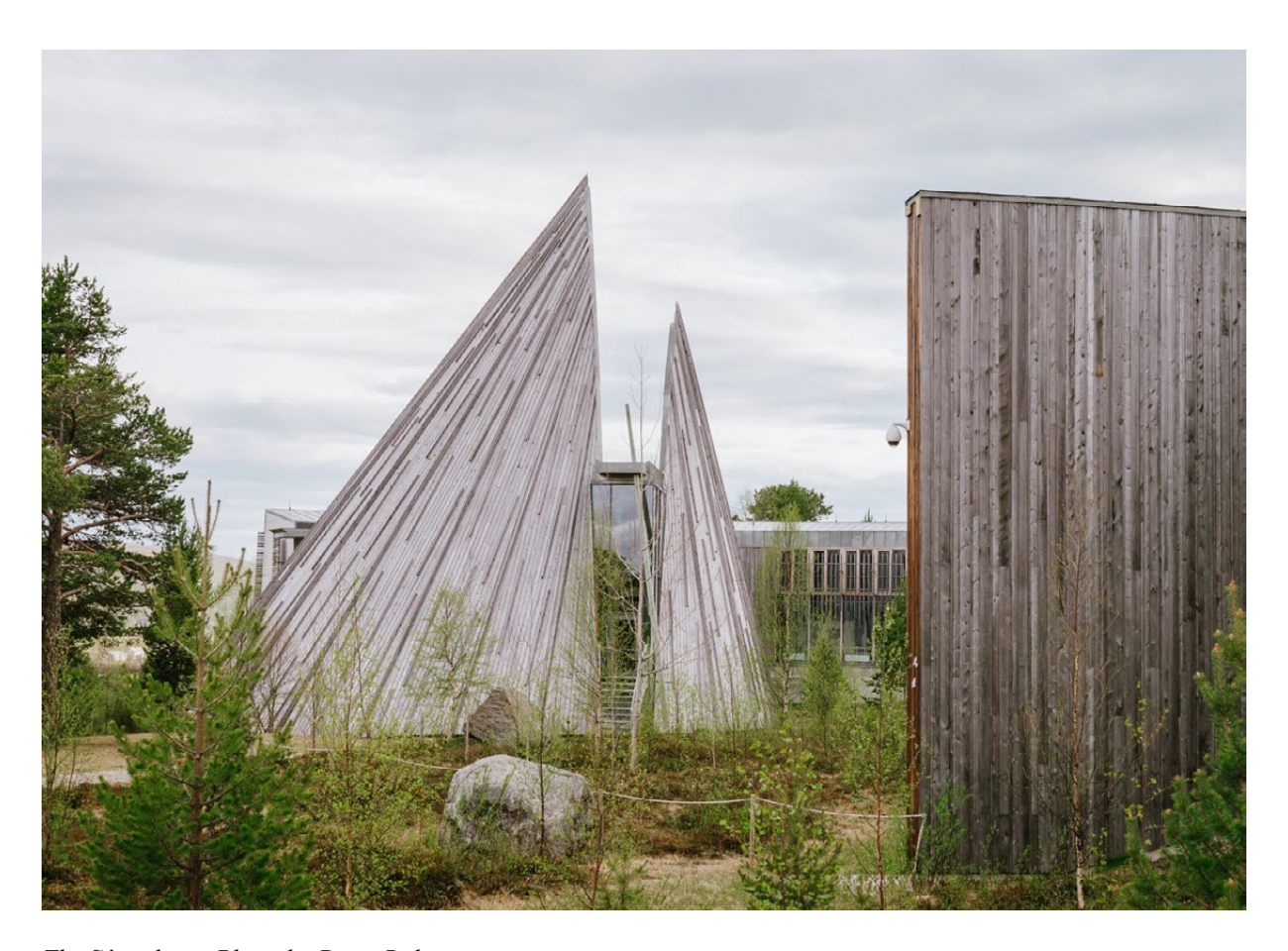
The Sámediggi.

Parliament sits in the wooden lavvu-inspired structure in the centre, while the library and the offices populate the building that surrounds it. The parliament can address all issues considered to impact Sámi people, although powers are limited, and decisions are not necessarily considered by the Norwegian Parliament.