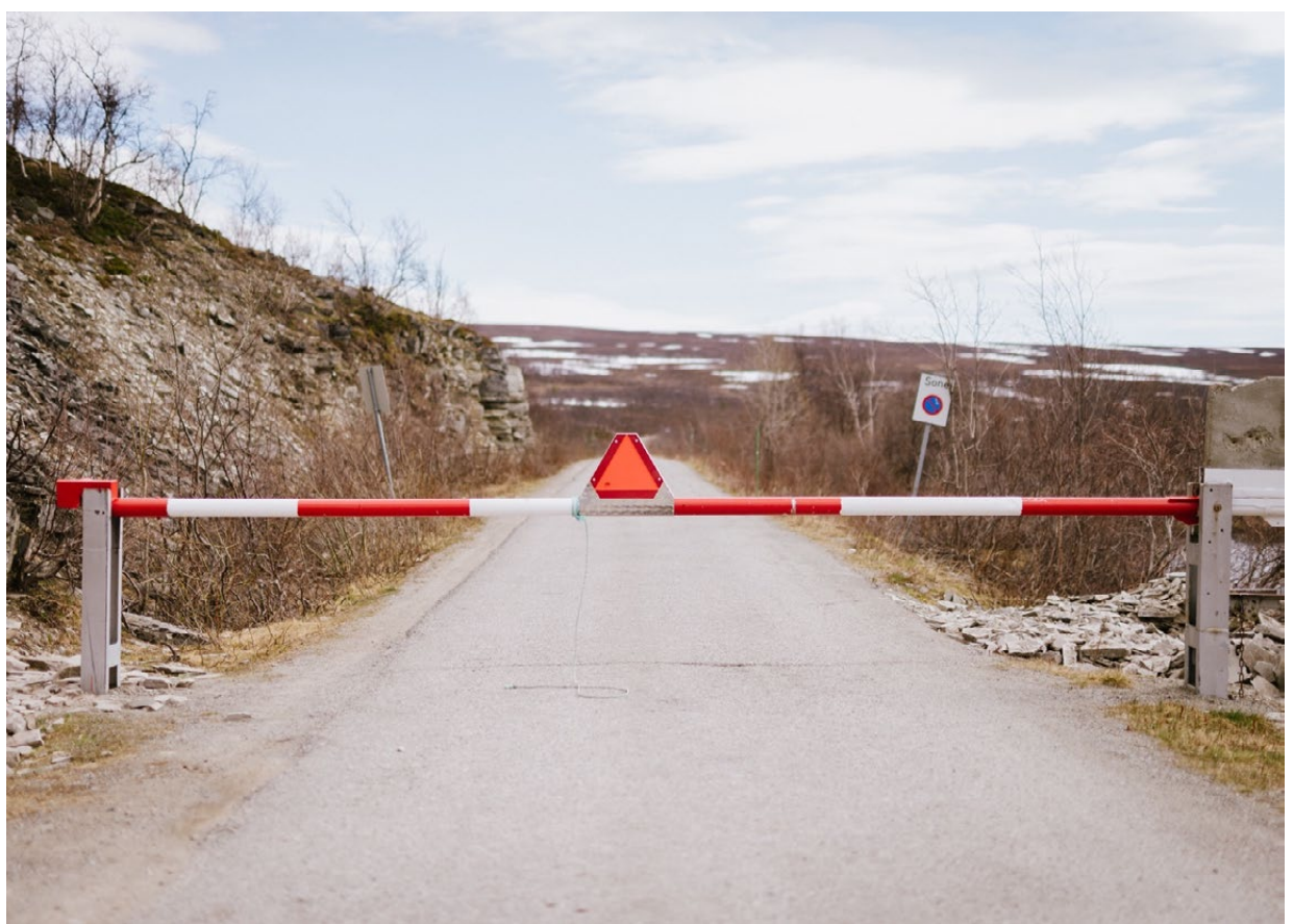
Point Zero, May 2016.

Today, a barrier is all that marks 'Point Zero' – the site of the biggest act of civil disobedience in Norwegian history (photo below). This is where the protestors build their ice barricades to try to prevent the building of the road, which would eventually lead to the dam. It's still a controversial place – locked eighty-percent of the year and routinely vandalised.