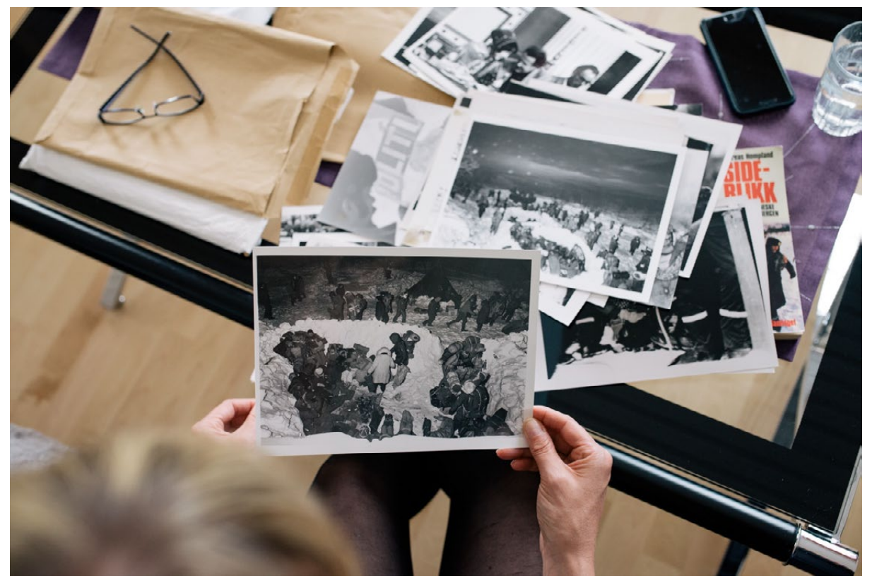
The protestors behind their ice walls blockading the road to the dam site.