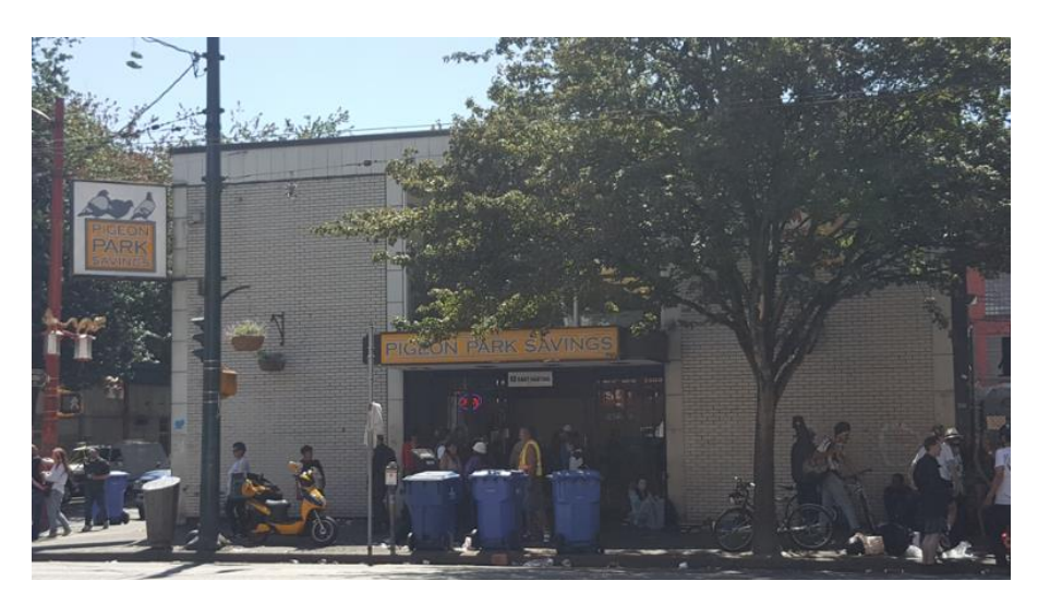
Another community-led solution for drug users in Seattle - Pigeon Park Savings

co-design process with consumers that went through a process of defining the issues and thinking about smart ways to make drug using safer. A "bong vending machine" was the outcome and this was designed and built. Their rationale was that if people were using drugs then they needed to do it safely using a clean bong. The cost was minimal for the purchase of the bong and was set by the users to ensure that they could afford to purchase one. This project was flexible and yet focused, working at a local level, with local needs. It may not have solved the drug using problem, but it ensures that the drug users are using equipment safely, and it was their idea!