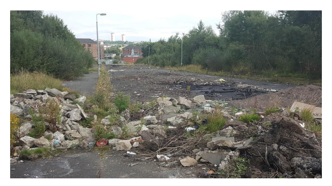
Community solutions currently being sought for the issue of littering and dumping in Possilpark in Glasgow

organisations to recruit, screen and refer people looking for jobs to a training programme which helps prepare them for the nearby airport's application process. Because of long-term involvement, recruiters now understand White Center residents' aspirations, strengths and barriers. They then hold a job fair for White Center residents and almost everyone gets a job because they are very well prepared. They have also set up an airport-based case manager to follow up with residents for the first year of employment and this helps them stay in the jobs. This didn't happen quickly. It came through trial and error, long term investment and with the assistance of "Trusted Advocates" working with the airport employer to look at barriers residents faced (for example lack of English, form completion difficult)<sup>4</sup>.