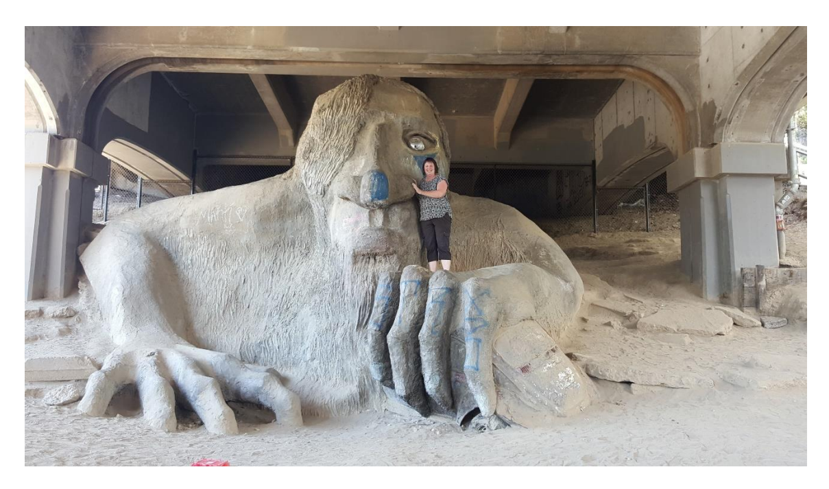
The Fremont Troll in Seattle, a community solution and a tourist attraction