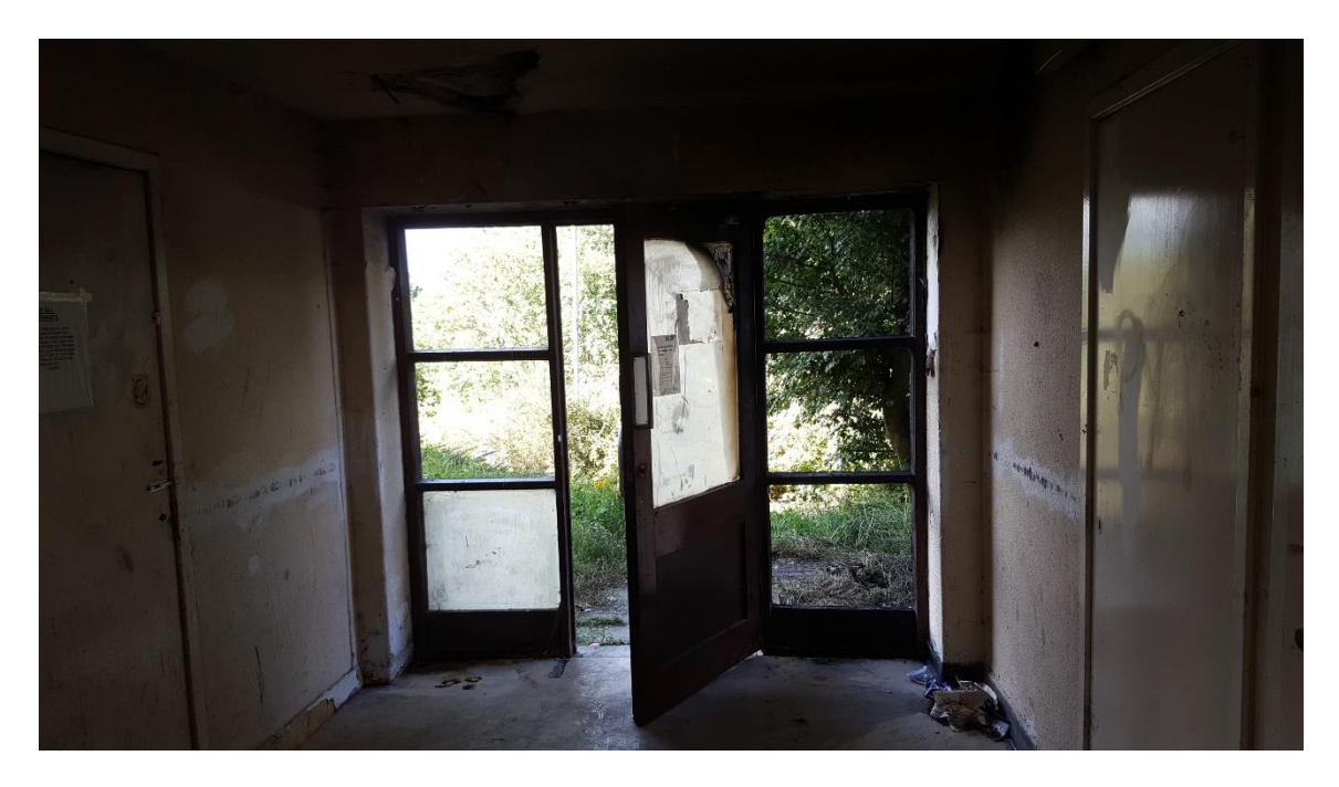
Barratt Action Group formed to tackle sub-standard housing at The Barratt Flats, Glasgow