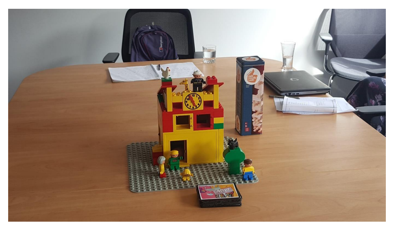
In the Boardroom at Leeds City Council - a Duplo construction that shares their simple vision for a Child Friendly

The key conditions for engagement with people facing multi-complex issues are wide and varied in nature. They highlight that what are often seen as simple solutions for engagement are actually grounded in complexity.