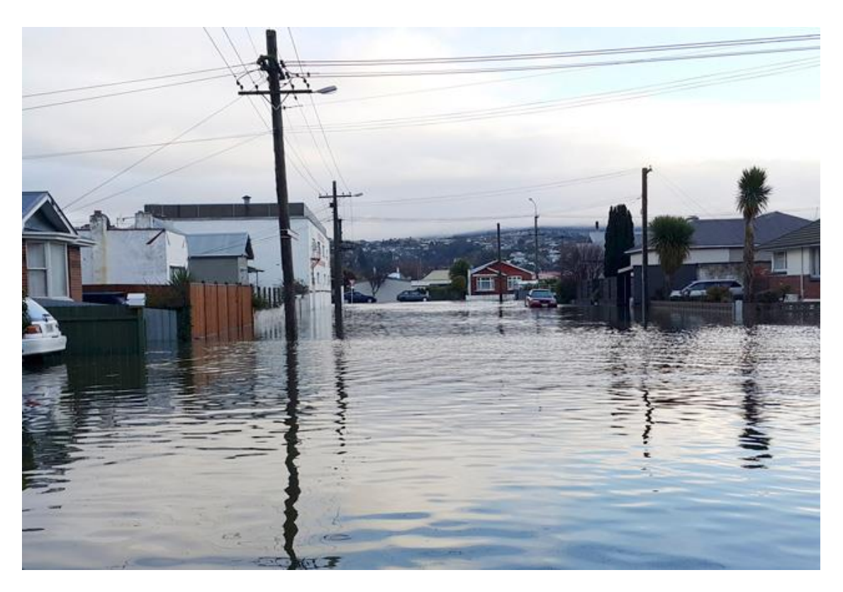
Widespread flooding in South Dunedin in 2015<sup>3</sup>

community remains an issue. Greater needs identified as part of the flood recovery include sub-standard housing, increased resiliency of the local community to withstand future events, and a more cohesive and co-ordinated inter-agency response. There are many agencies working in the area but there is a real need to work together collaboratively. The South Dunedin community feels that it is often "done to" rather than "done with", therefore a strengths-based community development approach is needed to build capability within the local community.