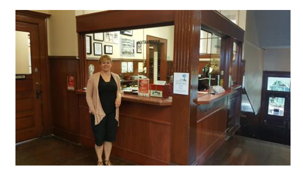
Phinney Neighbourhood Development Association