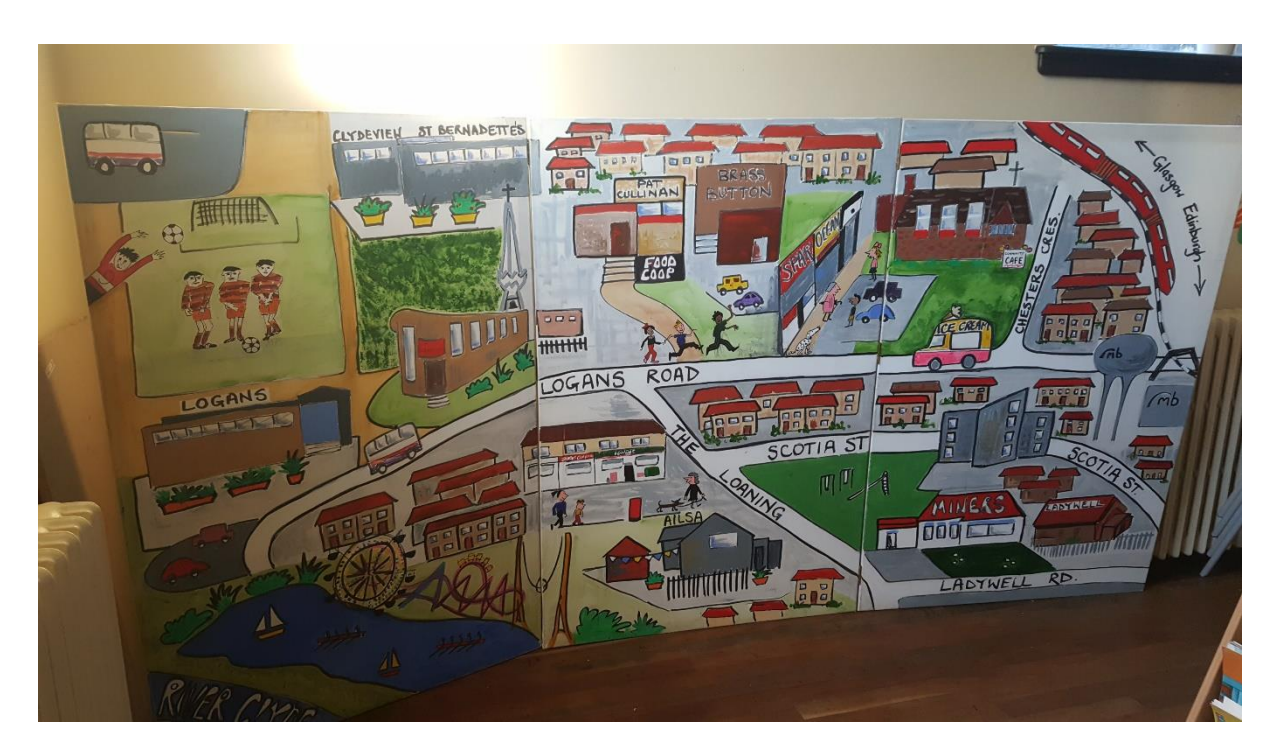
Asset map created in Motherwell, Scotland