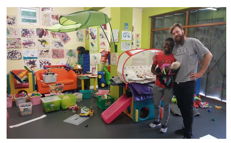
A visit to Streatham Youth & Community Trust where they are working with young people in an Irish travelling community

I then have brought together my notes from visits, interviews with people, resource material and observations and collated them under the broad four key questions to come up with 11 key learnings for engagement with communities facing multi-complex issues.