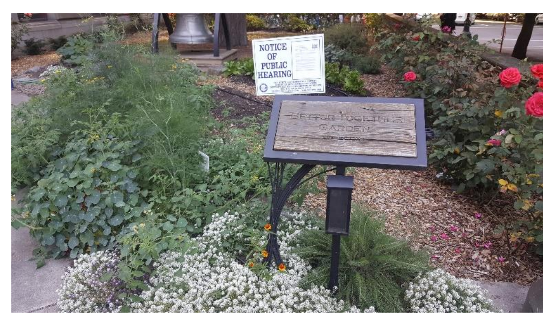
The Better Together Garden at the City of Portland

Their office has also focused on changing and improving local Government culture in terms of improving the quality and consistency of community engagement across the Council. They now have a City of Portland Public Involvement Advisory Council which is made up equally. This Council works on creating new community engagement policies, best practice, training, evaluation, and consultation support.