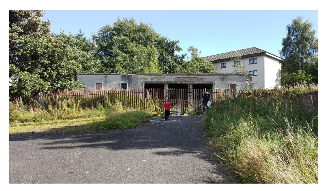
Entrance to the 197 Barratt Flats