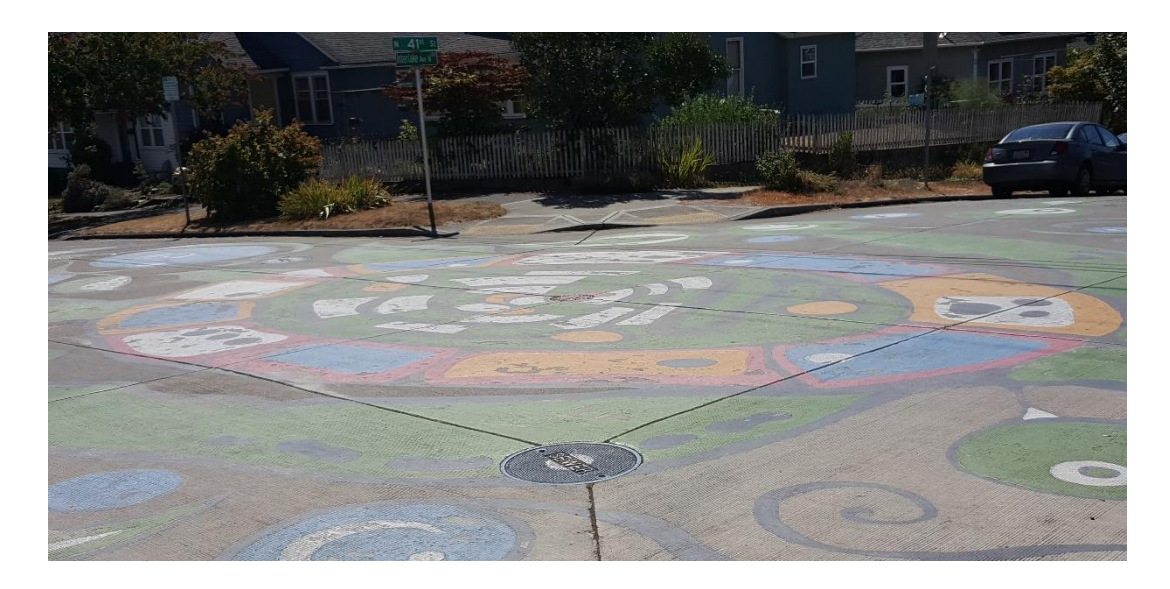
Intersection in Fremont designed to encourage engagement by community and place for connection