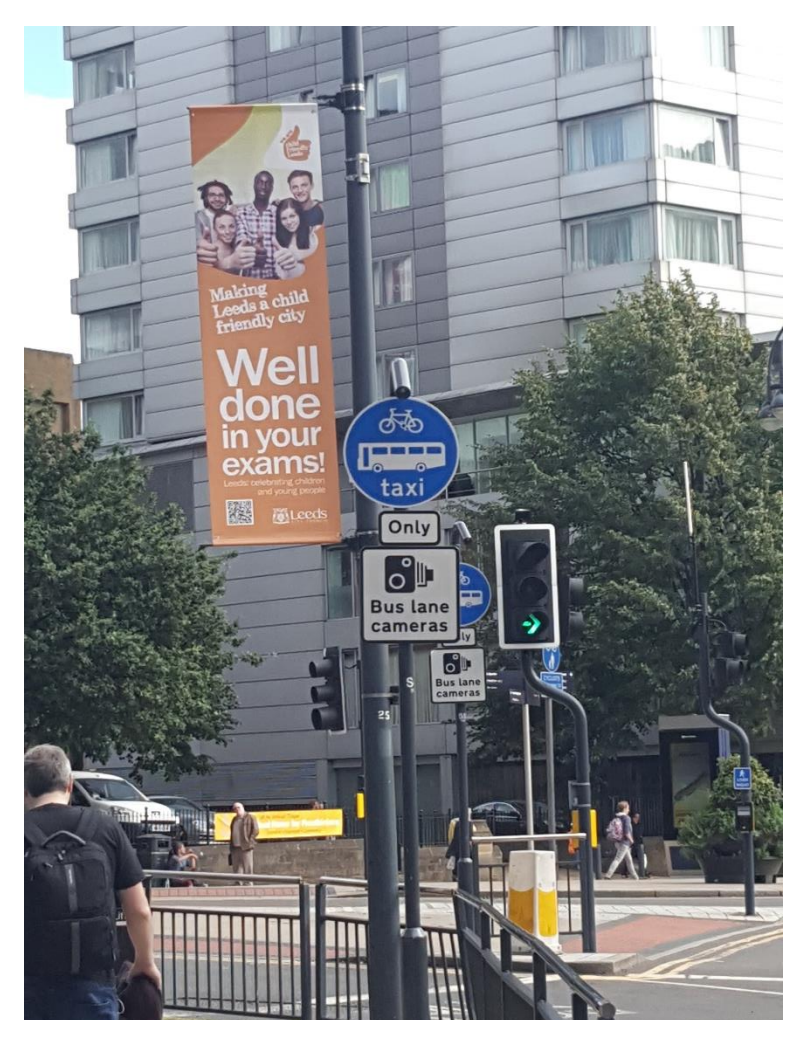
Child Friendly Leeds sign congratulating young people on their exams

people. It's a citywide strategy to improve outcomes for children in Leeds, which engages with and takes seriously the very group it seeks to support.