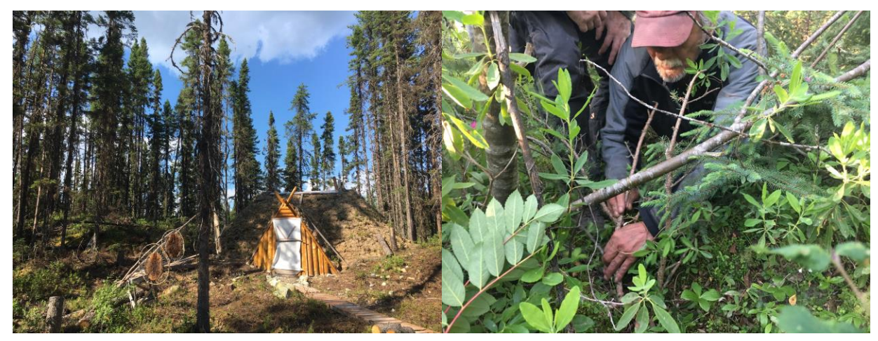
A winter cabin at Nuuchimi Wiinuu