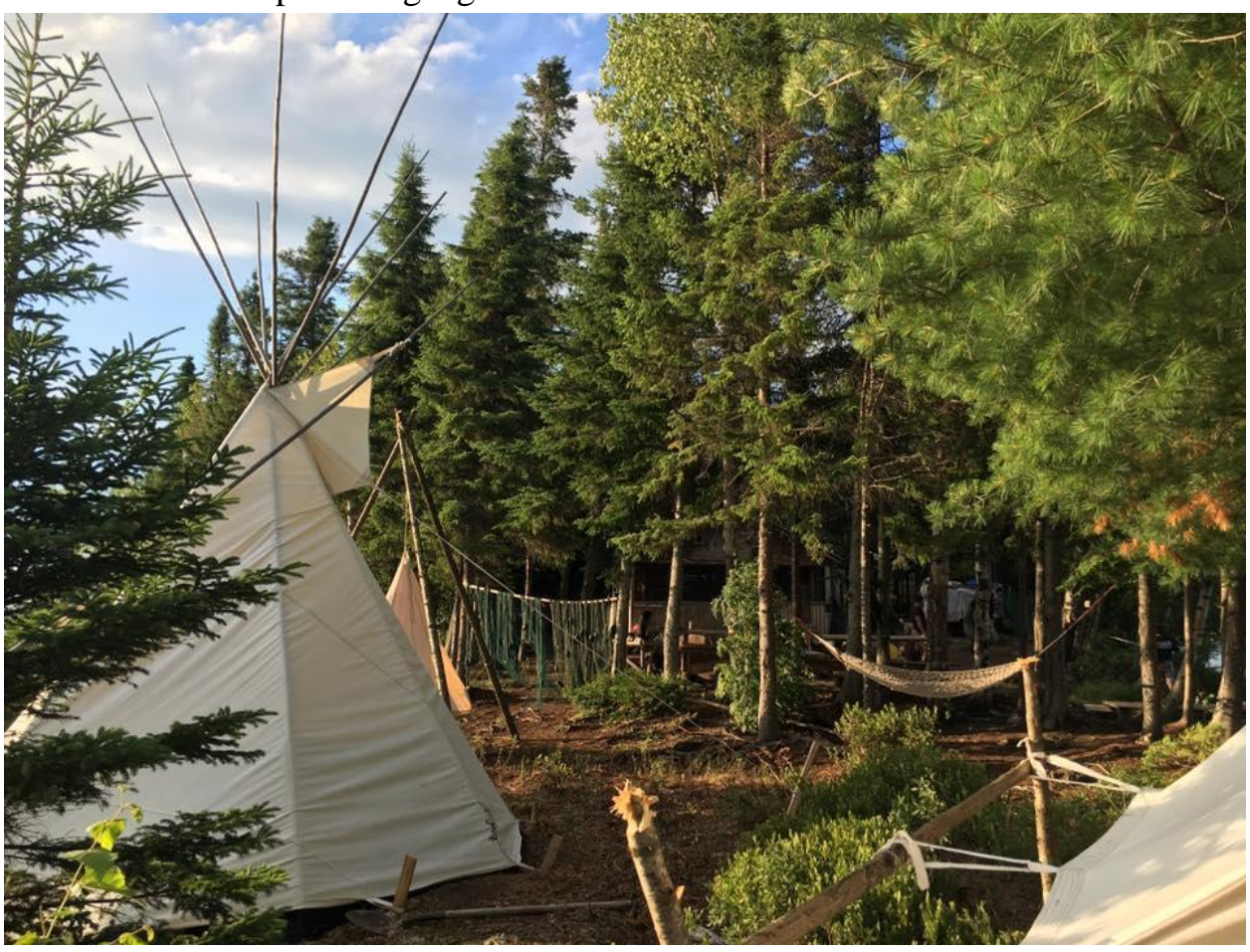
Accommodation at Camp Matakan

My stay at Camp Matakan was interrupted by a trip back into the reservation to celebrate Manawan's 110th year as a community. Celebrations included a large lineup of First Nations music acts from across Quebec, community gatherings, and a horseshoe throwing tournament. I met the chief of the Atikamekw people, and several community leaders who were pleased to have a chance to share their history with me.