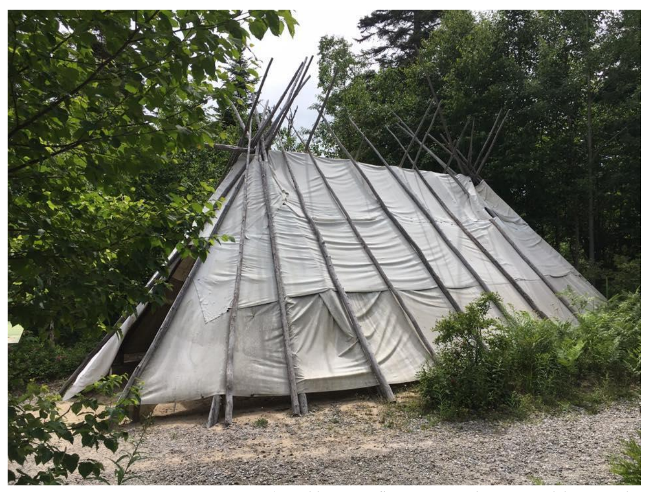
A traditional style Shaputuan dwelling at the Essipit community

The Whale Watching tour was well organised, hosted and conducted by local Innu people, and seemed to take advantage of the extremely rich marine environment in a low impact manner. A small zodiac took half a dozen passengers out on the St Lawrence for several hours observing Fin Whales, Humpbacks, Minke and Beluga.