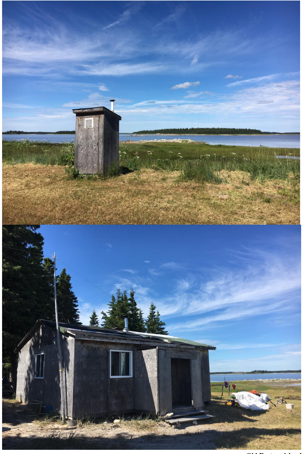
Old Factory island.