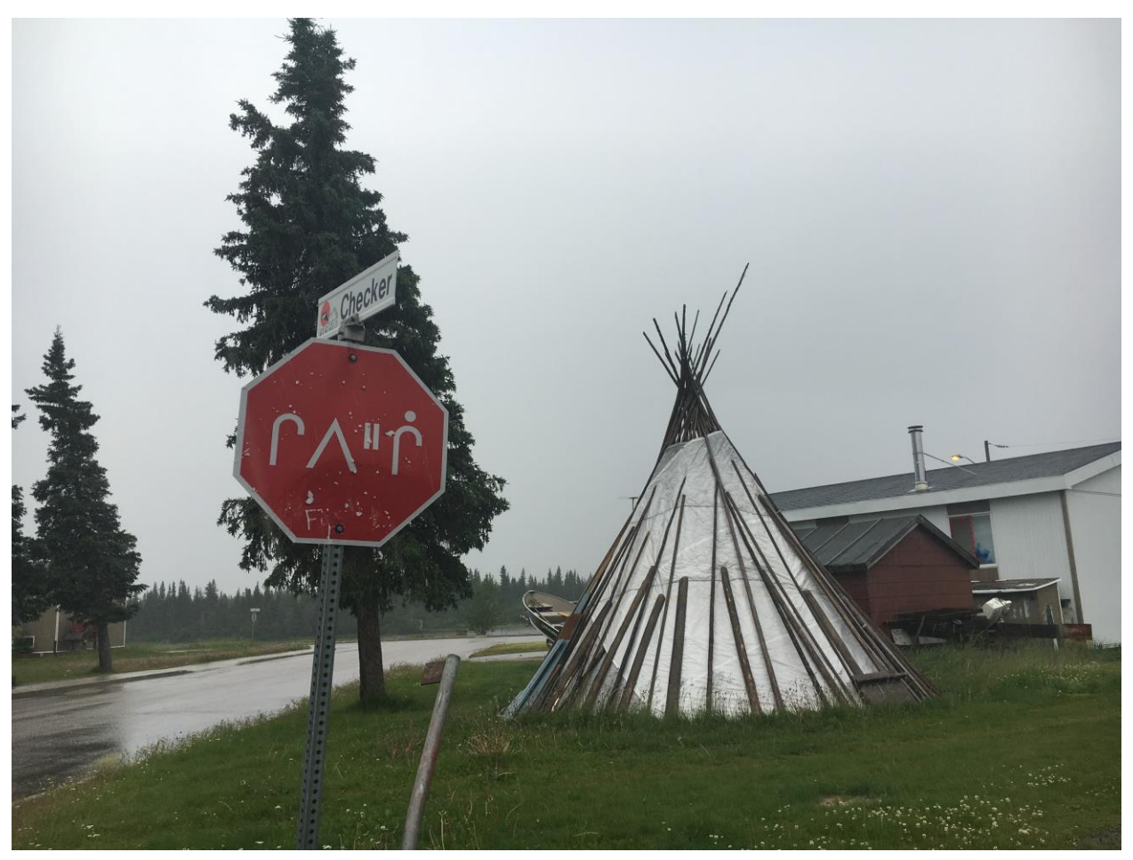
A smokehouse teepee in the community of Wemindji.

Originally the community had been situated on "Old Factory" island, 45 km north of Wemindji. In 1959 the community was relocated to it's current site. We stayed at a small hotel run by the community, which caters to contract workers moving through the territory on work for the Hydro or Mining companies.