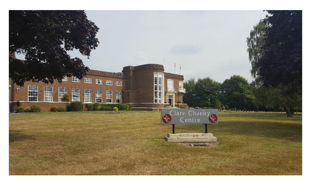
Child Bereavement UK was established 22 years ago as The Child Bereavement Trust, and rebranded as Child Bereavement Trust UK in 2012. The charity has two central roles –

Child Bereavement UK is located in the Clare Charity Centre, Saunderton, Buckinghamshire. The building is situated on the site of the Wycombe Union Workhouse (a building to provide work for the poor and unemployed) which was demolished in the mid-1950s. The current building was built for Ortho Pharmaceuticals Ltd between 1955 and 1958. In 2009, the building was purchased for the purpose of developing a hub for local charities offering subsidised accommodation, shared resources, and meeting and conference facilities (pictured below).