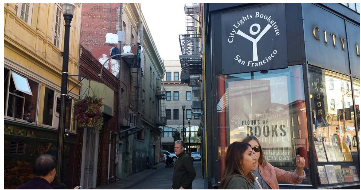
City Lights Bookshop

I spent a day in Berkley, beginning at the University of California, birthplace of the 1960s Free Speech Movement. Some signs of student protest greeted me.