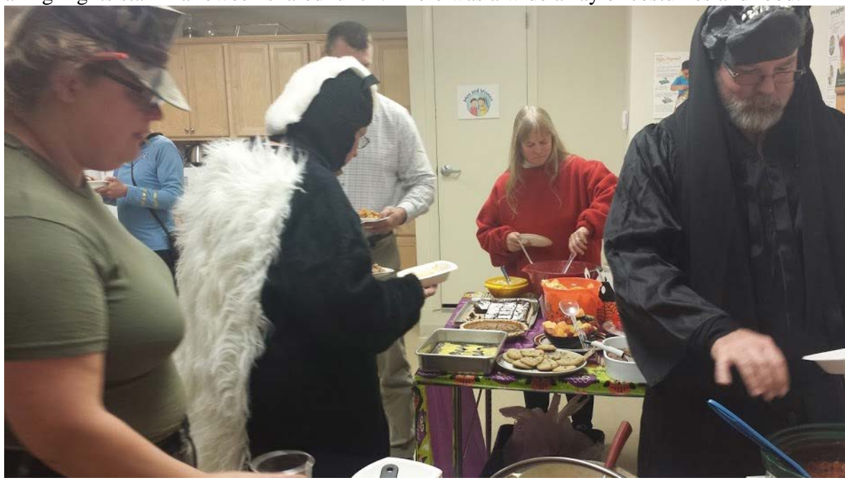
Halloween Lunch at Highlights Magazine

I spent time in the Highlights magazine office with script and illustrating editors. It was great to see the hands on approach, including lots of feedback letters from children. I also attended a Highlights staff Halloween shared lunch! There was a wide array of costumes and food.