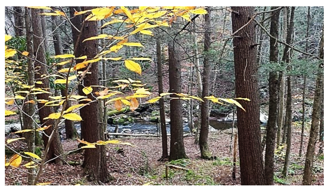
Woods near my cabin at the Highlights Foundation Retreat, Honesdale, PA

The Highlights Foundation is a non profit organisation set up over 30 years ago with the aim of improving the quality of children's literature by helping authors and illustrators hone their craft. They run workshops and retreats at their property, the former home of the actual founders of Highlights for Children, located near the company's offices in Honesdale.